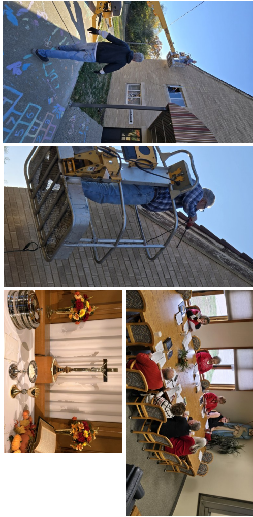
Assorted Pictures of Ministry Going on at St. John Lutheran